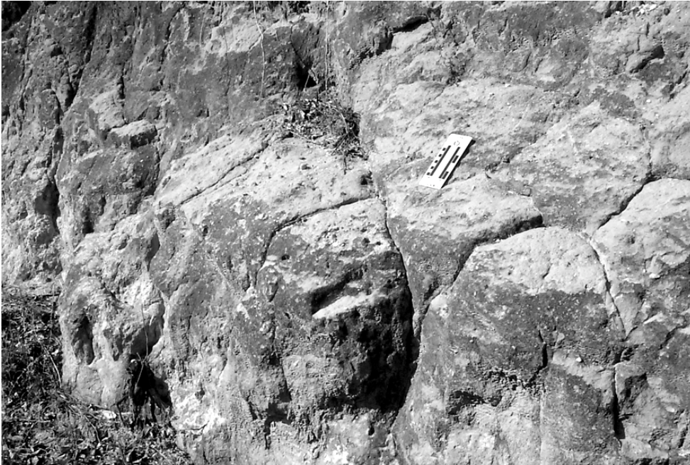
Fractured Miocene sandstone, Statesboro